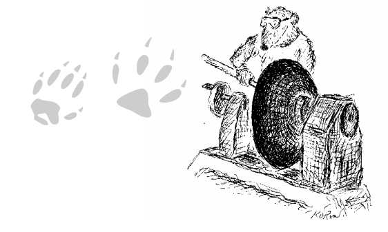
Volume 2, Issue 9