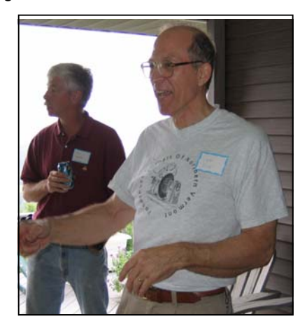
is safest to assume that the walnut oil you are using has the potential to induce allergies. Ted Fink

walnut oil is directly related to the purification or refining process. If done at lower (read less costly) temperatures the final product has more LTP and hence is more allergenic. So, since the LTP content of any given off-the-shelf walnut oil is not known, it