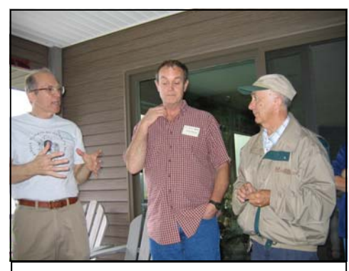
Between a rock and a hard spot?