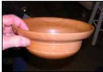
"Over The Top" sundae dish