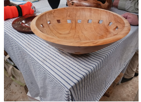
Some shots from the show and tell table