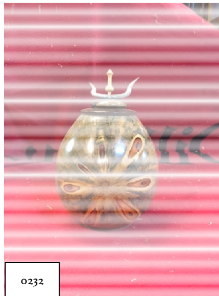
Photo # 0234 All that remains of a large cherry laurel tree. The orange color goes away when turned. It cuts very cleanly and finishes beautifully, white with reddish grain lines. It cracks easily when drying, so mostly we once-turn pieces from this.