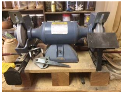
GRINDER/BUFFER BALDOR $155