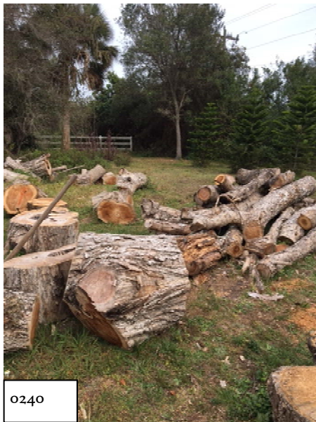
Photo # 0240: All that remains of a huge cache of Florida rosewood. This is our premium species. I turns nicely and finishes beautifully. Because it is so oily you can buff it without any added finish.