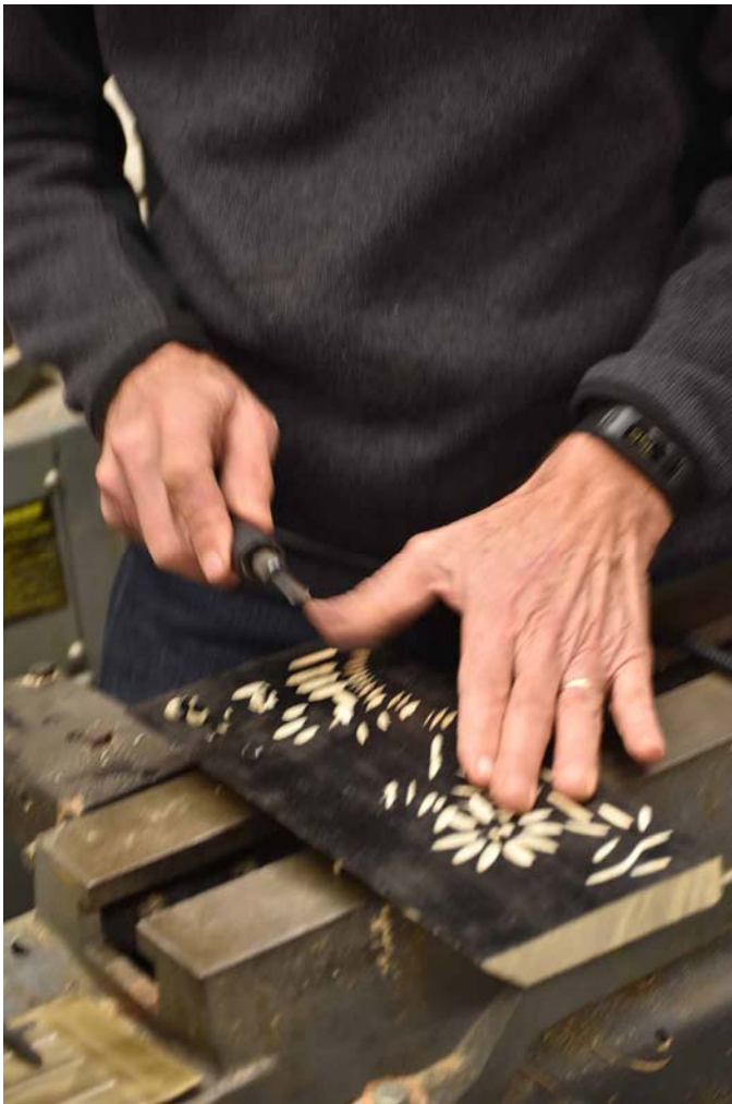
Using a power carver on painted wood.