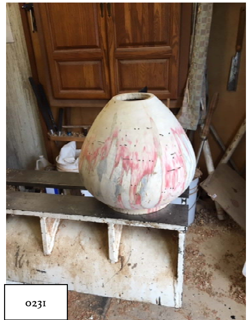
counting!.... for our members to make bowls to give to them which they then give to anyone donating $25 or more. This is a huge operation here! Last year they gave out over 9,000,000 pounds of food to needy Floridians!!