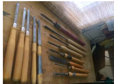
GREEN BOWL BLANKS A\various sizes and woods $10-20

Interested buyers should call Hav at 802-879-2066 and are welcome to come to his shop in Williston to inspect the items for sale.