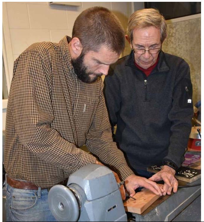
Here, you try it.