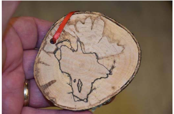
A section of a spalted branch, hung as an ornament.