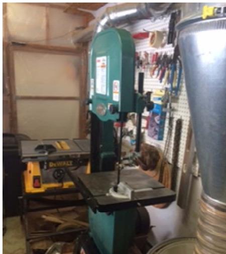
BAND SAW Grizzly Model G1019Z 14" $125